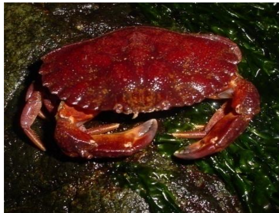
Red Rock crab